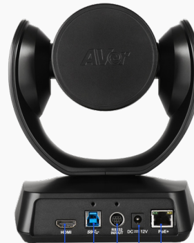
HDMI out USB 3.1 type-B RS232 in/out DC 12V LAN for IP streaming and PoE+